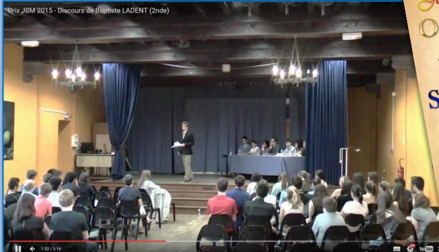
SCREENSHOT OF A VIDEO