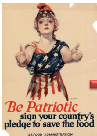
THE ORIGINAL POSTER...

► I really enjoyed using computer graphics software to realise the posters, and it was really fun to organize a real exhibition and explain my work to the other students. The posters were parodies of old propaganda posters, but there was also a propaganda message behind them.