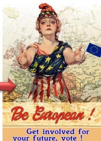
...AND MY PARODIED VERSION