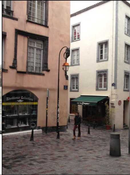
Pierre is now pausing and watch an old fountain in the middle of a little square.