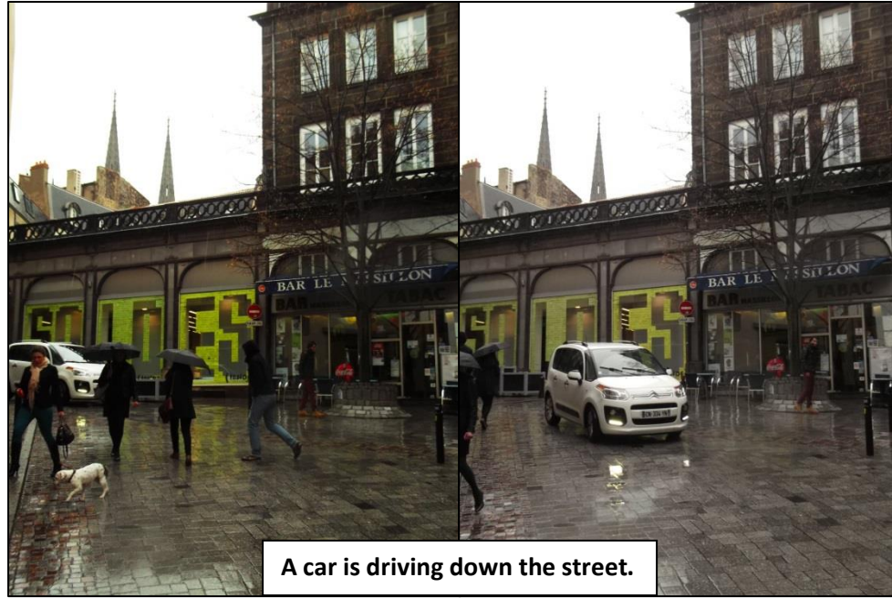
A car is driving down the street.